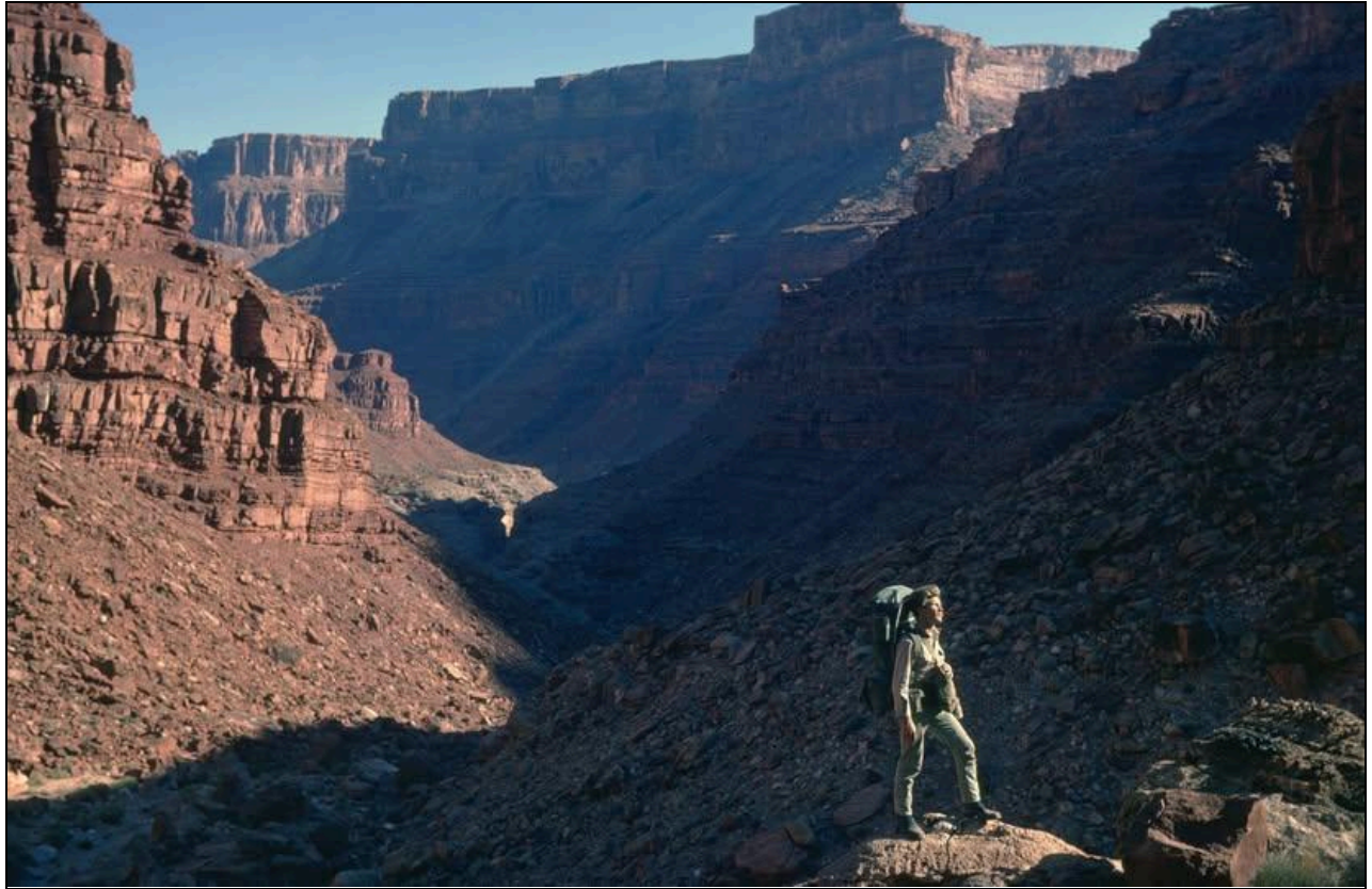
Ron's Facebook profile photo