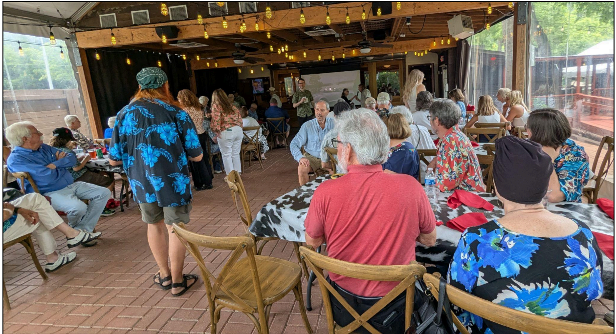
Celebration of Life at County Line BBQ